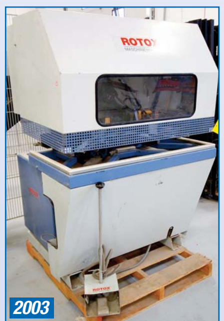
ROTOX KPA 373 SINGLE HEAD CORNER CLEANER