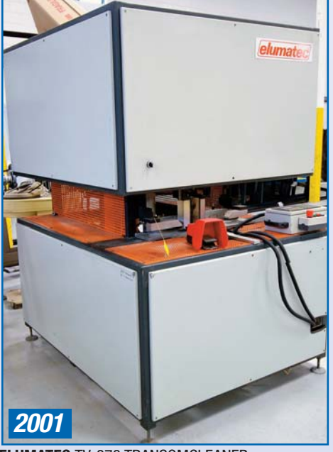
ELUMATEC TV-873 TRANSOMCLEANER