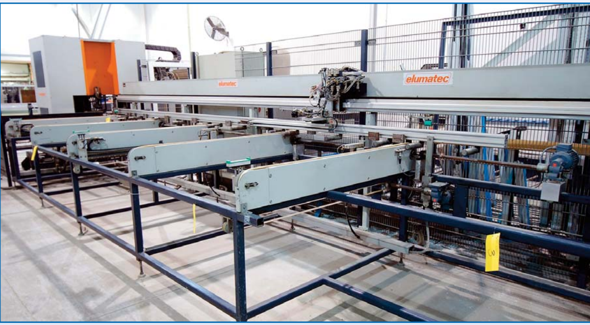
ELUMATEC SC-610 PROFILE PROCESSING CENTER