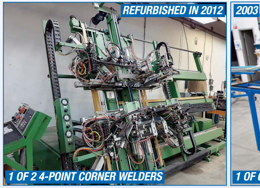
1 OF 6 CORNER CLEANERS

1200 Stellar Drive, Newmarket, Ontario & 2292 Rue de la Province, Longueuil, Quebec