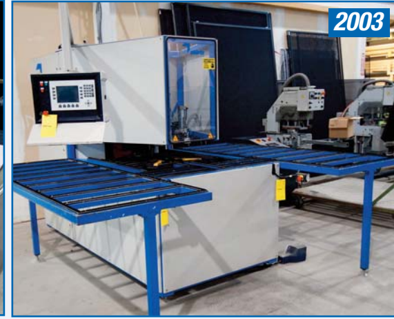
STURTZ SE-4AS-TC SINGLE HEAD CORNER CLEANER