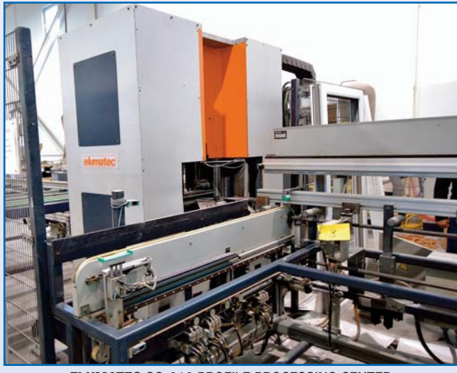
ELUMATEC SC-610 PROFILE PROCESSING CENTER